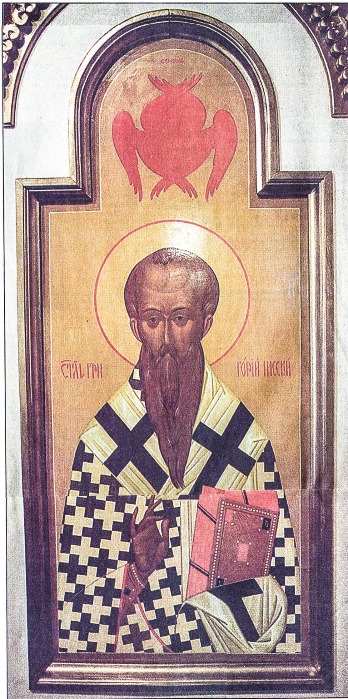
An icon of St. Gregory of Nyssa is on a doorway to the altar area of the Columbus church that bears his name.

Orthodoxy has become less ethnic in its makeup in the United States (Russian Orthodox, Greek Orthodox, Syrian Orthodox, for example) and more diverse in its membership. Today, there are an estimated 6 million Orthodox Christians in the United States.