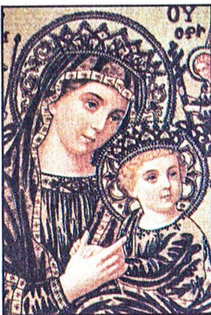
The Virgin Mary and the baby Jesus are depicted in a wood cut from Egypt at St. Mary Coptic Orthodox Church in Prairie Township.

Every brushstroke, every color, every tilt of a head has meaning, say those who make icons and those who venerate them. But these works of art — religious images typically painted on wood — aren't found only in Orthodox churches and in the homes of Orthodox Christians. They have become popular with other Christians — the result of greater exposure to this art form and of a desire for an inspiring image to focus on when praying.